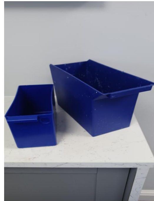
Milk Cleaning Containers