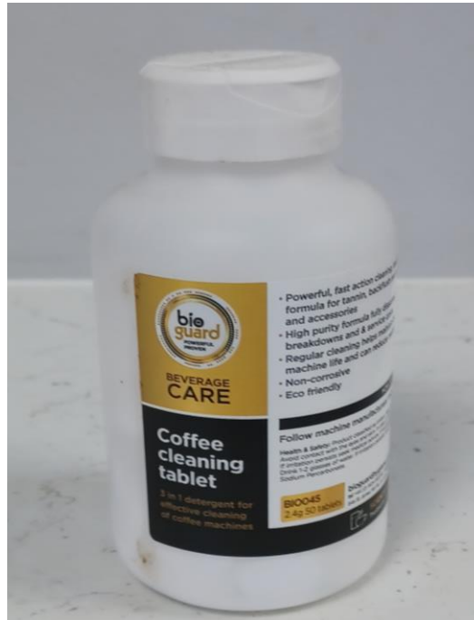
Coffee Cleaning Tablets