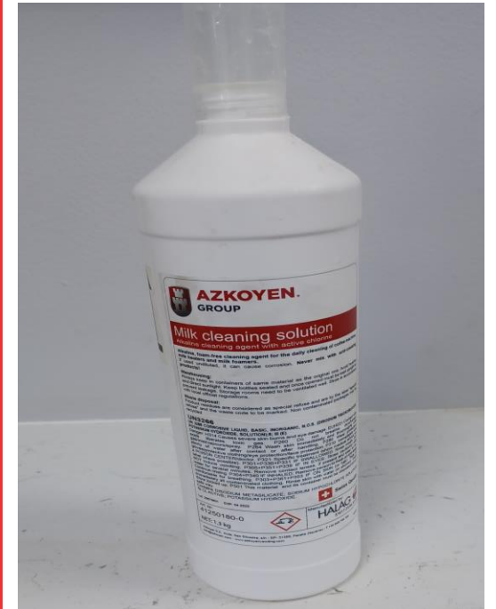
Milk Cleaning Solution